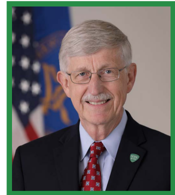
Francis S. Collins, M.D., Ph.D.

In 2015, the Sexual & Gender Minority Research Office (SGMRO) was established to expand the National Institutes of Health (NIH) research activities in sexual and gender minority (SGM) populations, remove related systemic barriers, encourage a robust and engaged SGM research workforce, and evaluate progress made on the goals of the NIH FY 2016–2020 Strategic Plan to Advance Research on the Health and Well-being of Sexual and Gender Minorities . Since its inception, the SGMRO has worked diligently with NIH's Institutes, Centers, and Offices to pursue the goals of this plan.