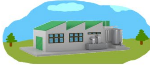
Microbiome Mining Factory - Industrial Scale. Off the Shelf