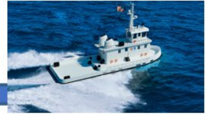
Marine Harvester – Planning Stages