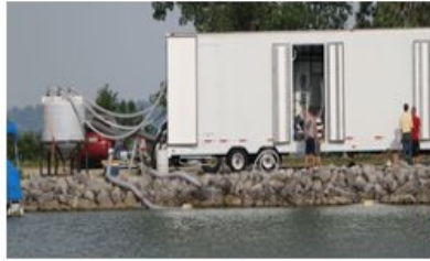
Near Shore Mobile Aquatic Harvester – Fully Developed