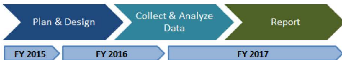
Figure 2: Project Plan Phases

A summary of the phases discussed in the project plan is shown below: