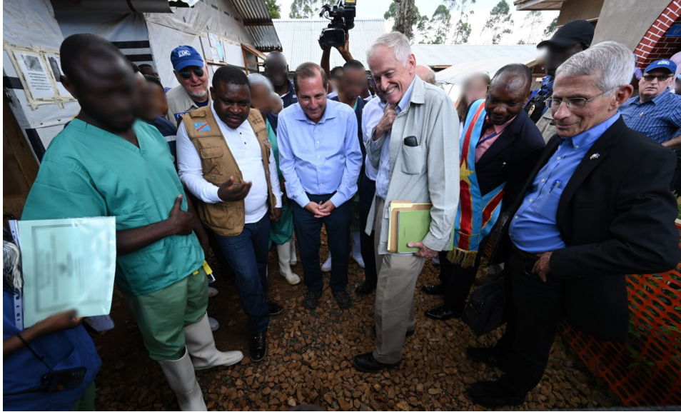
Members of the U.S. delegation to the Democratic Republic of the Congo speak with a boy who had just been told he no longer had Ebola in Butembo, Democratic Republic of the Congo

National Security Council, led a delegation to the DRC, Uganda, and Rwanda to see the situation on the ground and communicate the Trump Administration's commitment to bringing the outbreak to an end. Dr. Redfield had previously visited the region during the outbreak.