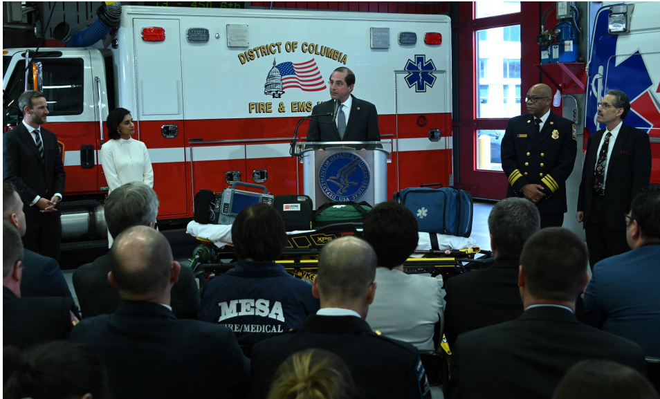
Secretary Alex Azar speaks at a press conference announcing the Emergency Triage, Treat, and Transport (ET3) Model

enrollment process by aiming to improve the accuracy and consistency of eligibility determinations across states.