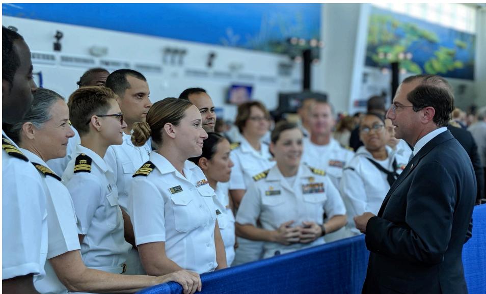
Secretary Alex Azar speaks with U.S. Public Health Service Commissioned Corps officers at an event launching the USNS Comfort mission to Latin America

A new ventilator for vulnerable populations: ASPR supported the development of a portable ventilator capable of providing mechanical respiratory support for critical care of newborn babies, adults and elderly patients. The Philips ventilator was cleared by FDA earlier this year for use in institutional, home, and field settings by minimally trained operators and is now stockpiled in the Strategic National Stockpile for immediate distribution when needed.