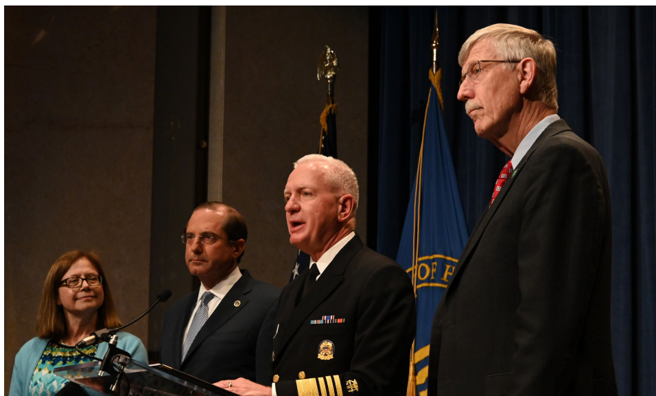
Assistant Secretary Brett Giroir speaks at a press conference at HHS

Office on Women's Health support for screening and treating women and girls: The Office on Women's