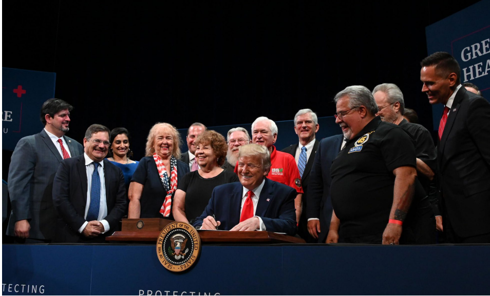
HHS Secretary Alex Azar, CMS Administrator Seema Verma, and others look on as President Trump signs an Executive Order on Protecting and Improving Medicare for Our Nation's Seniors

New virtual care coverage: In Medicare and Medicare Advantage, doctors can now receive compensation for a much broader range of services delivered virtually, like phone or video check-ins.