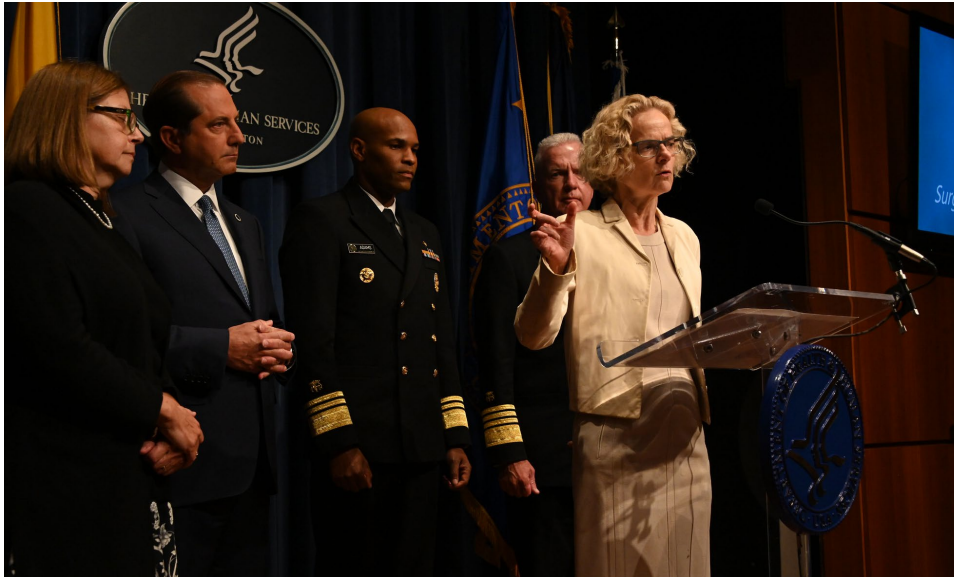
National Institute on Drug Abuse Director Nora Volkow speaks at a press conference at HHS

Health supported the work of 20 grantees in training more than 500 primary care and OB-GYN health providers to use the evidence-based screening, brief intervention, and referral to treatment services (SBIRT) approach to support patient care.