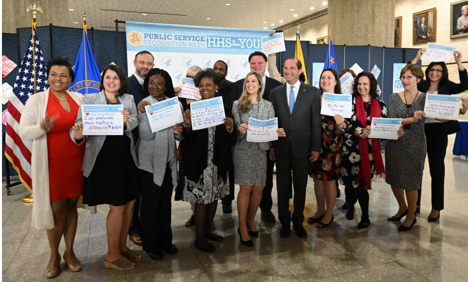
Secretary Alex Azar and HHS employees participate in Public Service Recognition Week activities at HHS

Engagement Index increase of 0.7 percentage points in 2019, to 73.5, which is 5 points higher than the overall government-wide average.