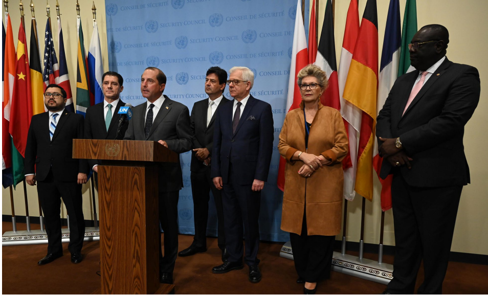
At the United Nations General Assembly, Secretary Alex Azar joins representatives from other countries issuing a joint statement coalescing on the principle that there is no international right to abortion

ready to deploy within eight hours—as part of a force that stands at over 95 percent readiness—Commissioned Corps officers responded to 32 disaster responses, planned events, and community health and services mission, representing 12,372 days deployed.