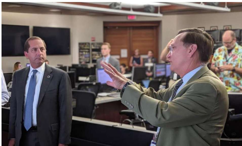
Secretary Alex Azar receives a briefing from Assistant Secretary for Preparedness and Response Robert Kadlec in the Secretary’s Operations Center at HHS

Ongoing responses from a ready Commissioned Corps: In part using deployment teams that are