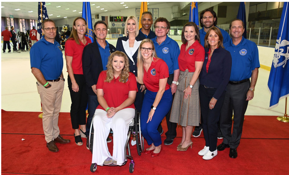
Members of the President's Council on Sports, Fitness, and Nutrition join Ivanka Trump, Advisor to the President, and HHS Secretary Alex Azar at an event launching the first National Youth Sports Strategy

Supporting community collaboration for youth sports: As part of the Youth Engagement in Sports Initiative, the Office of Minority Health and Office on Women's Health co-funded 18 grantees with the aim of identifying characteristics of effective collaborations that improve physical activity and nutrition via increased sports participation, especially for disadvantaged youth or those in communities with no or few sports programs.