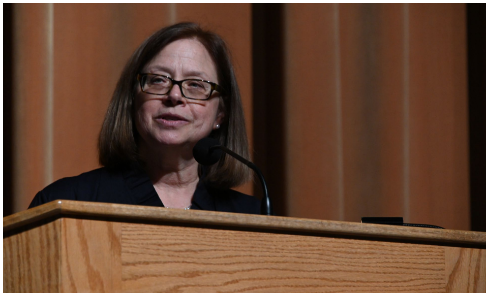
Assistant Secretary Elinore McCance-Katz speaks at the SAMHSA Prevention Day event

Working toward an improved suicide hotline: SAMHSA submitted the National Suicide