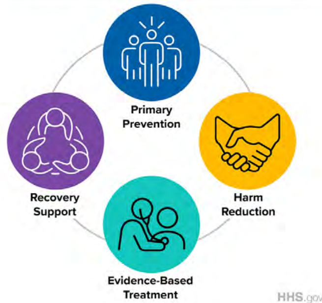
Figure 2. HHS Overdose Prevention Strategy Substance Use Continuum

Primary prevention focuses on intervening before a disease or condition occurs. High-value benefits derived from primary prevention span multiple sectors, including health care, public safety, the criminal justice system, and beyond—both broadly speaking and within marginalized communities. Working to prevent higher-risk behaviors and disease from happening in the first place has many benefits, including financial benefits, prevention of unnecessary human suffering, and reduced negative societal impacts. 26,27 Estimates