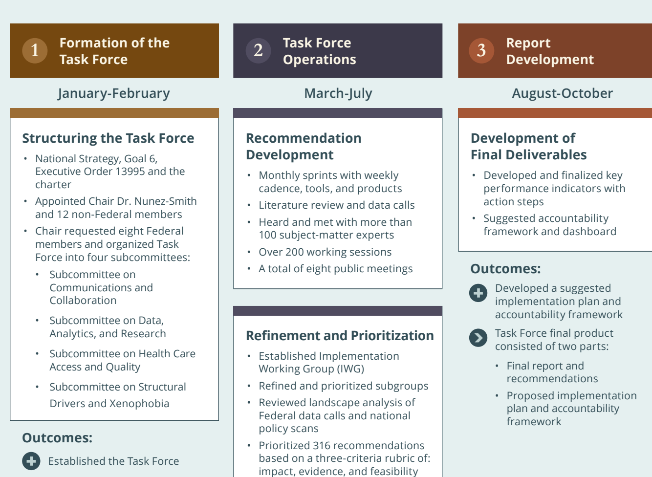
Figure 1: COVID-19 Health Equity Task Force Process