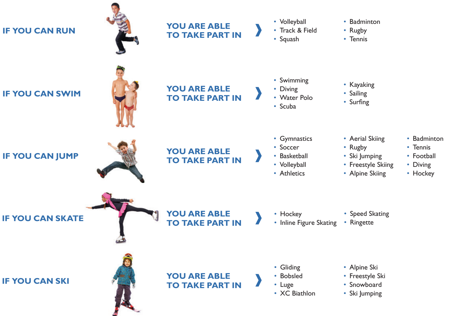
Figure 1. Transition of Fundamental Movement Skills to Fundamental Sport Skills, inspired by authors of Canadian Sport for Life

To become physically literate, a person must have proficiency in all three elements (ability, confidence, and desire) of this definition from the Aspen Institute. Additionally, communities must provide environments and organizations that allow physical literacy to occur naturally. With rising concerns over reduced activity levels, lack of affordable and accessible sport and recreation opportunities, and the overly competitive focus of youth sport programs, conversations on the national level need local, evidence-based examples of how physical literacy can find success in addressing the general health of our population.