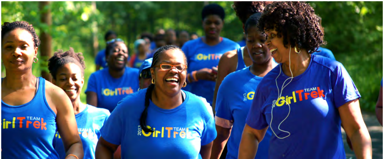
GirlTrek encourages women to walk every day.