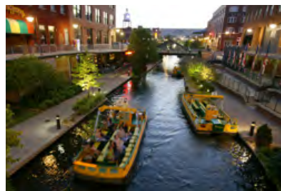
Oklahoma City has redesigned public spaces to make them more walkable.