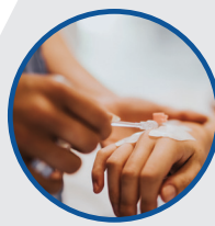
New cancer treatments