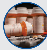
Addiction treatment programs