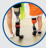
Artificial limbs and prosthetics