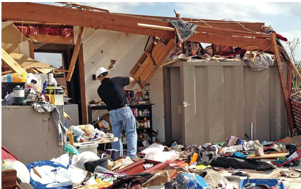
Figure 3. A local building code inspector inspects an above-ground shelter that performed well in a heavily damaged area

Note: The above list of construction projects is not all inclusive; please consult your local code official to determine requirements for your project.