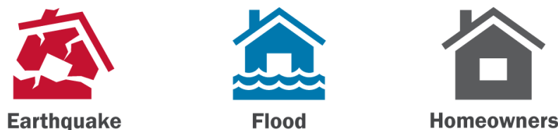
Figure 5. Types of natural hazard insurance