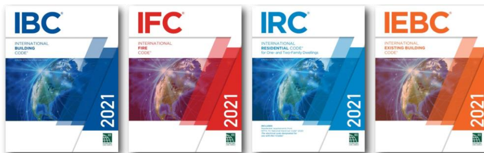
Figure 6. Covers of the most popular building codes developed by ICC

The most popular building codes are the International Building Code (IBC), International Residential Code (IRC), International Fire Code (IFC), and the International Existing Building Code (IEBC). Some additional building codes designed for other types of construction include the International Wildland Urban Interface Code (IWUIC), International Plumbing Code (IPC), International Mechanical Code (IMC), and the International Energy Conservation Code (IECC). The ICC publishes new editions of the International Codes every three years. For a full list of the most recent family of building codes, visit: www.iccsafe.org/products-and-services/i-codes/the-i-codes .