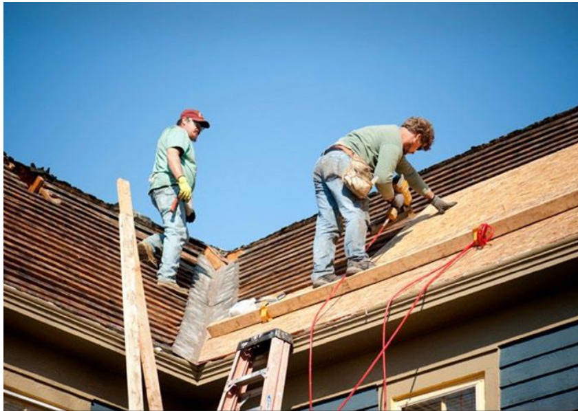
Figure 4. Two construction workers fix a roof on a home that had been damaged in Crisfield, Maryland after Hurricane Sandy came through the area.