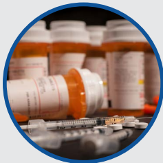
Addiction treatment programs