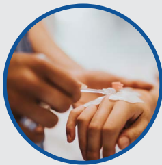
New cancer treatments