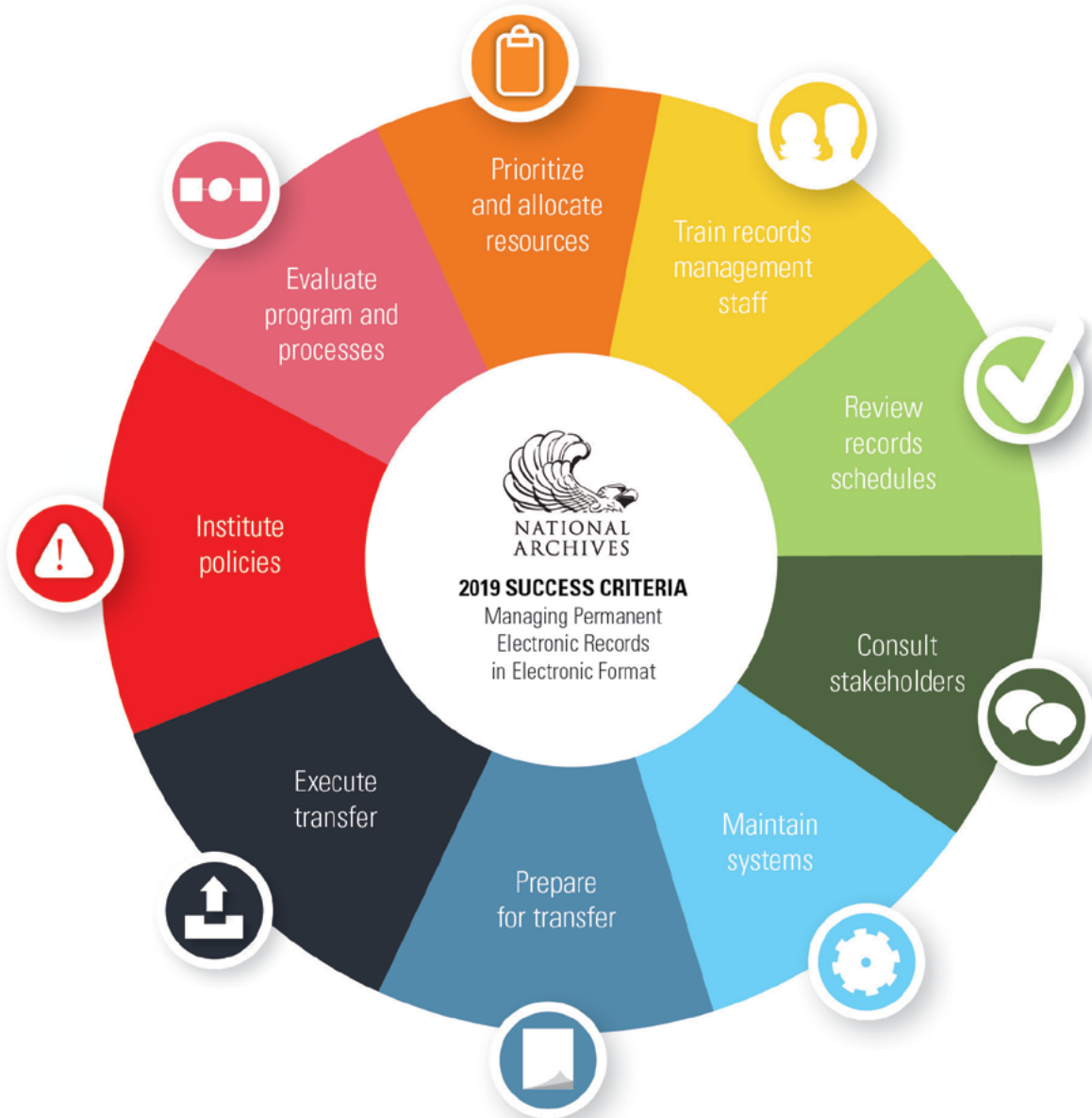
Figure 2: Operational Activities Wheel

your agency’s records management program. Due to the variances in size, structure, culture, and other factors, agencies may need to incorporate additional activities to meet their business needs.