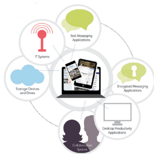
Figure 1: Location for Electronic Records

This document also includes a crosswalk for these three sections demonstrating the relationship between them to clarify how these products assist agencies on a path to success.