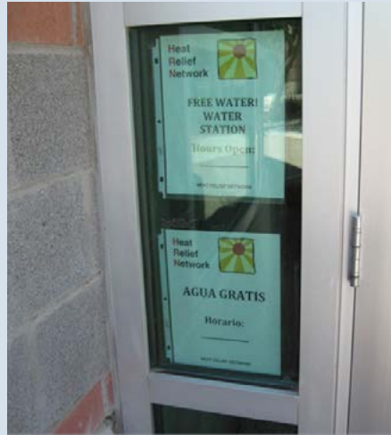
Signs for free water at a cooling center in Maricopa County, Arizona.

A cooling center (or “cooling shelter”) is a location, typically an air-conditioned or cooled building that has been designated as a site to provide respite and safety during extreme heat. This may be a government-owned building such as a library or school, an existing community center, religious center, recreation center, or a private business such as a coffee shop, shopping mall, or movie theatre. Some counties have set up cooling sites outdoors in spray parks, community pools, and public parks. Sometimes temporary cool spaces are constructed for events such as a marathon or outdoor concert.