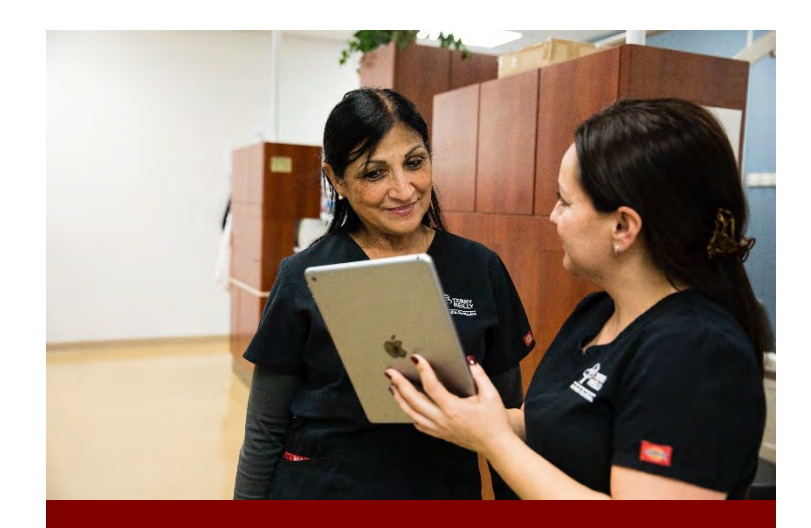
In 2018, NCHWA released a series of reports that provide estimates and projections of the country's behavioral health workforce through 2030.

The NPDB is a web-based repository of information on medical malpractice payments and certain adverse actions related to health care practitioners, providers, and suppliers.