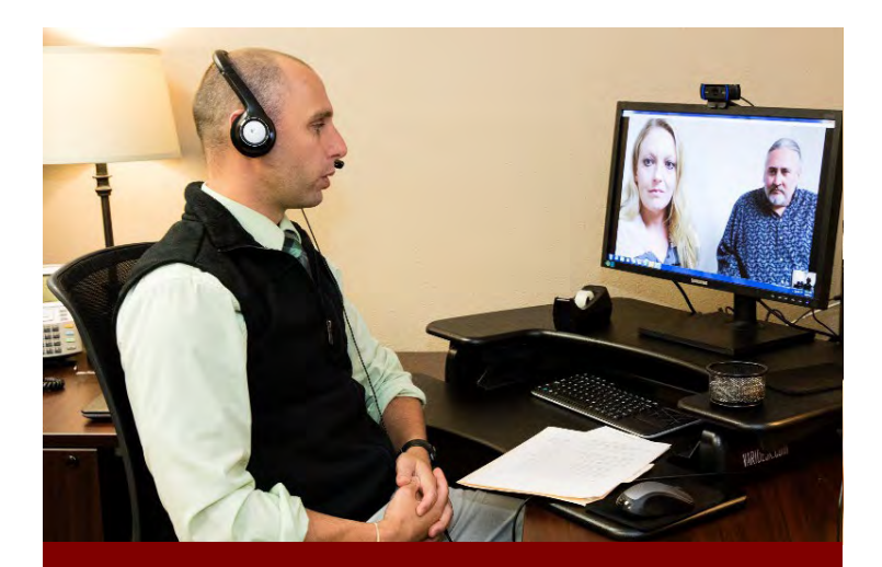
BHW-sponsored programs offered training at more than 5,000 substance use treatment facilities in academic year 2017-18