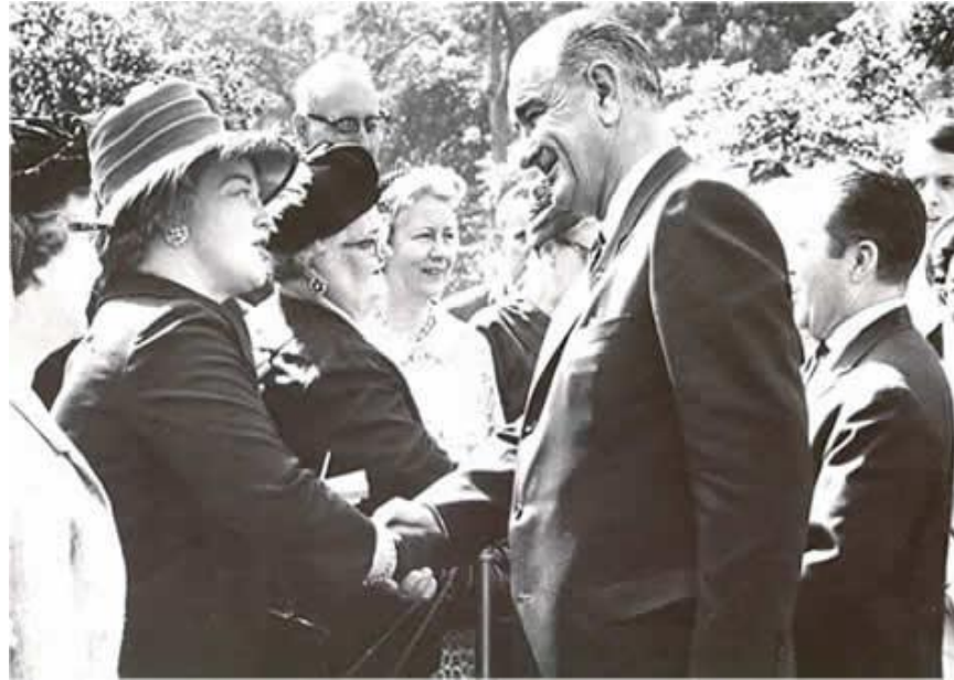
President Lyndon Johnson at the signing of the original Title VIII legislation