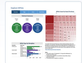
Health Professional Shortage Areas (HPSA)