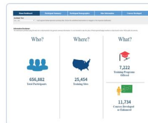
Health Professions Training Programs