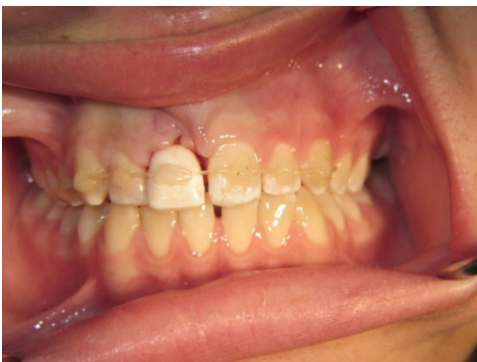
Figure 9. Front teeth with a splint.

The avulsed tooth has been reimplanted and a fishing line is bonded to the teeth as a splint.