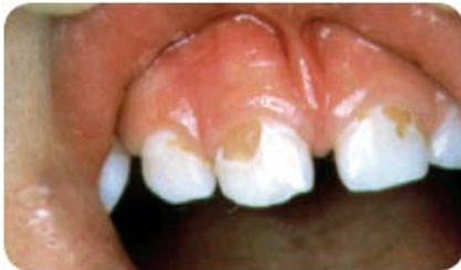
Figure 4. Cavitation of enamel. 1