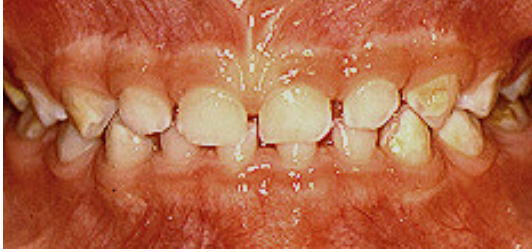
Figure 2. Enamel defects on maxillary and mandibular canines. This is not caries.