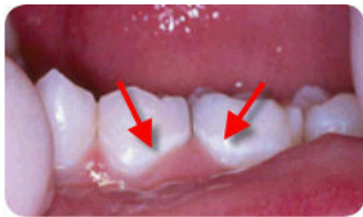
Figure 6. White spots on tooth surface