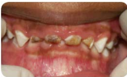
Figure 5. Severe decay. 1

If this process continues unabated, the infection will lead to necrosis of the pulp of the tooth and result in a localized dental abscess. Continued progression of the infection into the dental-alveolar ridge causes bone loss and an alveolar (the bone surrounding the teeth) abscess. The infection can continue to spread into nearby tissue and cause facial cellulitis, Ludwig's angina, meningitis, or septicemia. As the pulp is the innervated portion of the tooth, it is not until the pulp tissue is infected (pulpitis) stage that pain signals a problem.