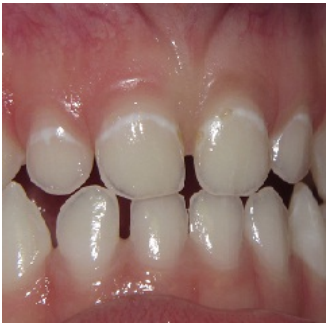
Figure 3. White spot lesions on primary incisors with small areas of cavitation.