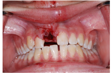
Figure 8. Mouth with a front tooth missing. The socket for missing tooth has blood