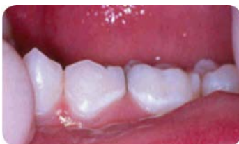
Figure 1. White spots on tooth surface 1