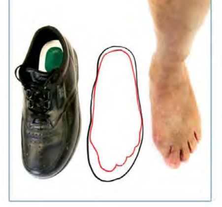
Fig. 1 Improperly fitting shoe with the borders of the foot outside the tracing of the insert.