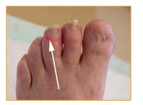
Fig. 3 Look for any areas of discoloration.