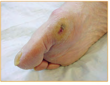
Fig. 2 Untrimmed callus acts like a rock in your shoe. It can cause damage to the underlying tissue or even an open sore as you walk.