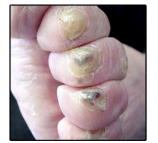
Thick nails can cause pressure on the nail bed

Improperly cut nail is too short and into the corners of the nail.