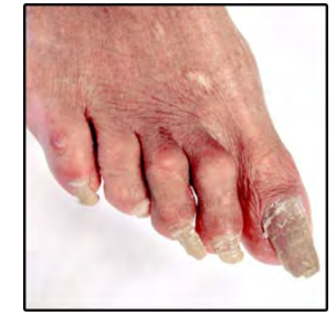
Long nails can damage surrounding skin