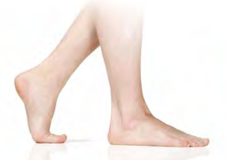
Walking barefoot puts excessive pressure on the bottom of the foot and can cause an ulcer.