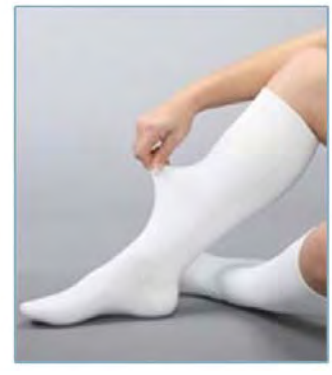
Seamless socks can prevent pressure problems.