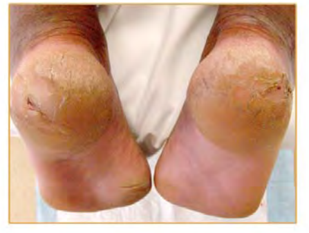
Fig. 4 Cracking of the callus allows bacteria to enter the skin and can cause infection.