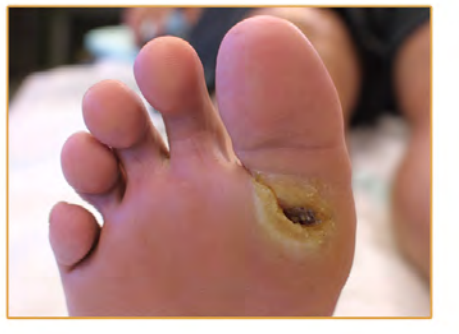
Fig. 1 Heavy callus becomes dry and cracked and can cause an ulcer.