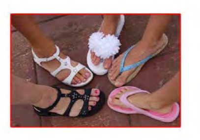
This type of shoe fails to protect your feet from the environment and the straps can cause pressure.